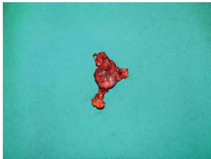
Figure 3. The image of specimen for hemiagenetic thyroid gland